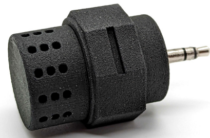
Sonicu incubator monitoring sensor