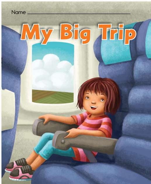
From Phonics to Reading Level A, Student Edition

The connection between what we teach and what we have young learners read has a powerful effect on their word-reading strategies (Juel and Roper-Schneider, 1985) and their phonics and spelling skills (Blevins, 2000). It also affects their motivation to read. Examine a few pages from the books you give your students to read in K–1 during phonics lessons. They should be able to sound out over fifty percent of these words based on the phonics skills you have taught them up to that point. If not, more controlled accountable text will be needed until they get more phonics skills under their belts and develop a sense of comfort and control in their reading abilities. You can usually transition to more challenging text in the second half of Grade 1.