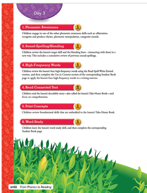
From Phonics to Reading Level A, Teacher's Edition

Teachers often spend too much time on activities they enjoy or are easier for students and less on the more challenging or “meaty” activities that increase learning. Keep lessons fast-paced and rigorous. Use the suggested times as a guideline and work towards increasing the pace of activities that might take longer. Phonics should be fun, with students active and engaged during the entire lesson—thinking and talking about how words work. The bulk of time should be devoted to “real reading and writing” experiences.