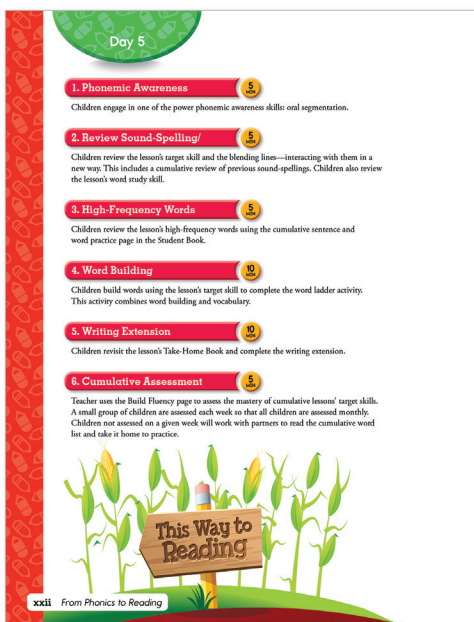
From Phonics to Reading Level A, Teacher's Edition

Teachers with a background in phonics or linguistics are better equipped to make meaningful instructional decisions, analyze student errors, and improve the language and delivery of instruction.