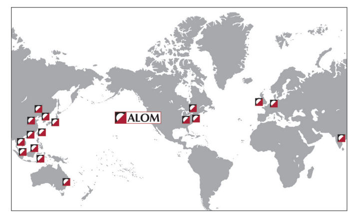
ALOM's 18 global locations are convenient to the world's industrial and consumer markets.