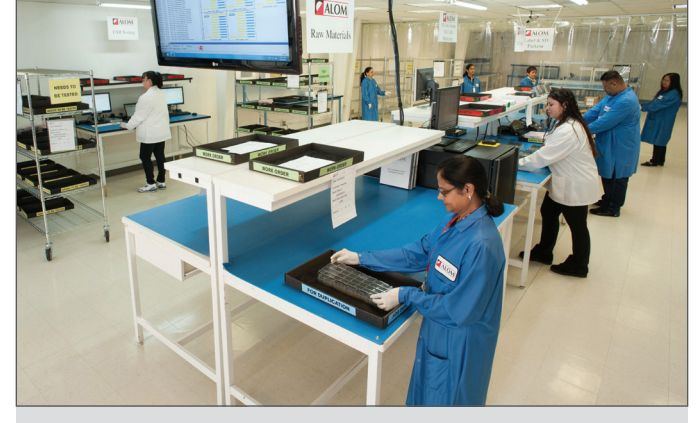
ALOM operates one of the world's largest digital media duplication facilities for SD cards, USB flash drives and other media, including software downloads and electronics configuration and repair.

Units 1603-4, 16th Floor, Causeway Bay Plaza I | No. 489 Hennessy Road Hong Kong | PH +852.15020.0276