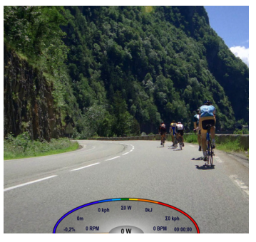
SHOWN: To the left is Bradox's LYNX Trainer with HD video screen, set up and ready to climb the Alpe d'Huez section of Marmotte, which is shown in the inset above