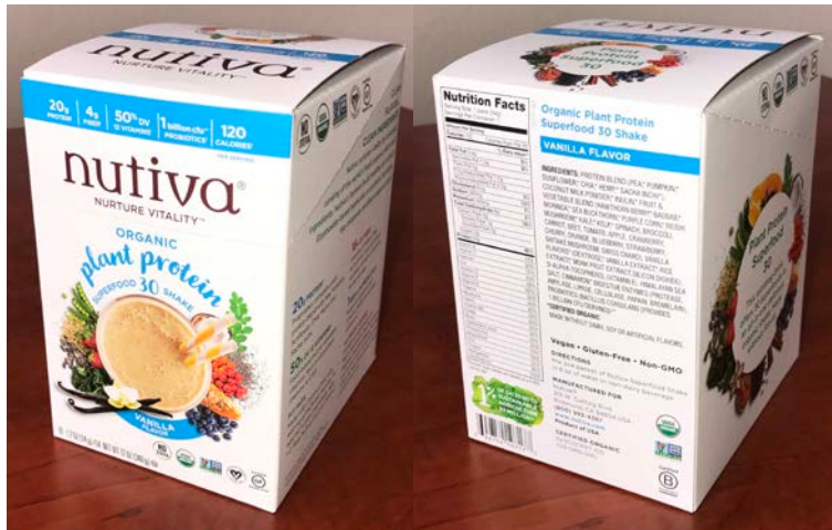
PBP201 DISPLAY FRONT