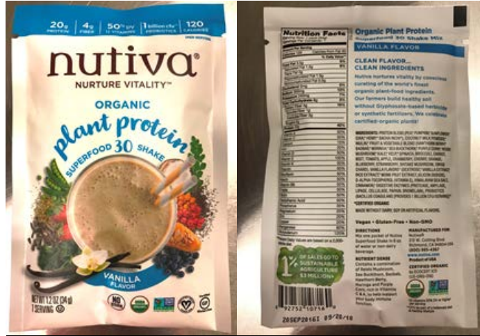
PBP201 FRONT PANEL