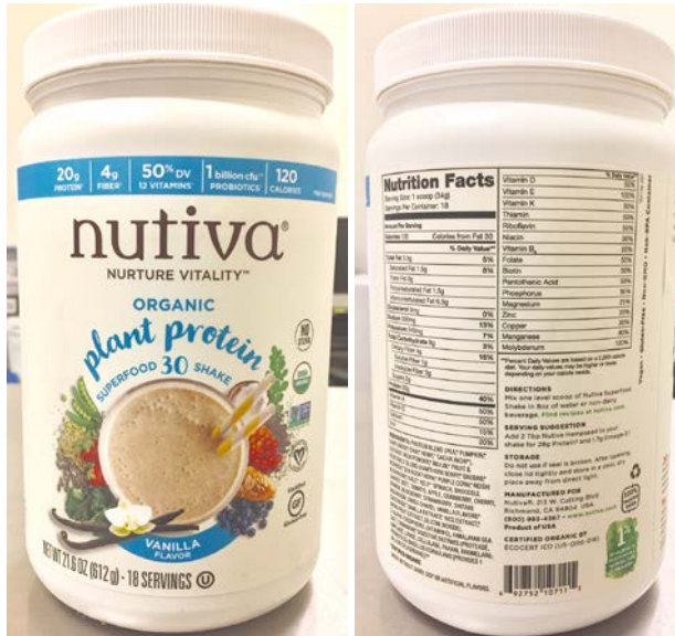
PBP205 FRONT LABEL