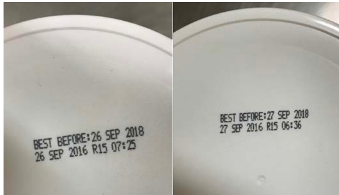
PBP205 CODE IMAGE 26SEP2016R